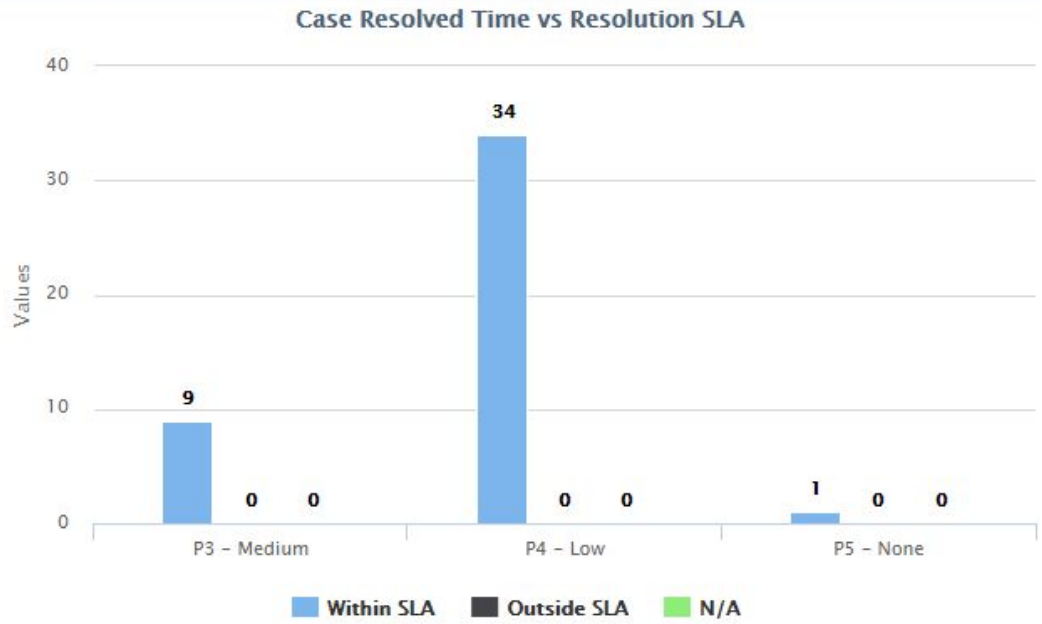
% of cases Responded to within SLA and outside SLA